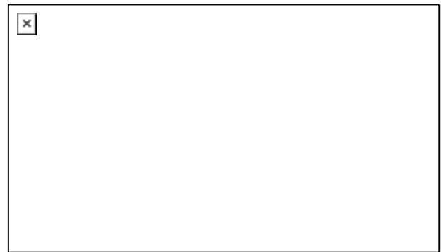
Fig. 1. Ozone content averaged over one day over Yakutsk during 1974–1984 (solid curve); N(\text{O}_3) deviations by \pm 2\sigma (dashed line); 2002 (J connected by line); 2003 (©); 2004 (+).

Climate Center of the USA 4 during 2002. These data are given for the 10th, 20th, 30th days of the month averaged over one day. Figure 1 shows that the ozone state, N(\text{O}_3) , is close to normal value. But on the 20th of February and on the 30th of August the total ozone content was below the mean value by more than 2\sigma . The observed ozone deficit on the 20th of February is determined by a global decrease of the total ozone content throughout the entire northern hemisphere, its value over Yakutsk is 367 Dobson units. The observed ozone deficit over Yakutsk on the 30th of August depends upon the arrival of the “hole” in the ozone atmospheric layer from the Arctic. The ozone hole size was about (1000 \times 1000) km 2 . This ozone hole was generated over the East Siberian Sea on July 30 and gradually moved along a curved path over the West Yakutia to the south of Yakutia. The speed of motion was equal on the average to about 100 km a day.